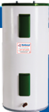
Electric 40 & 60 gallon tanks