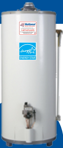
Conventional Vent 40, 50 & 60 gallon tanks